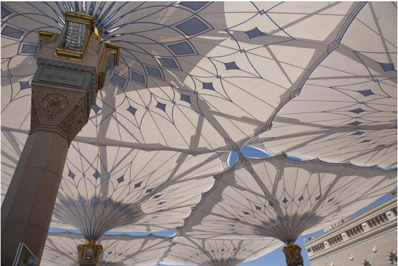
Above: The umbrellas now in place at the Piazza of the Prophet's Holy Mosque in Medina.