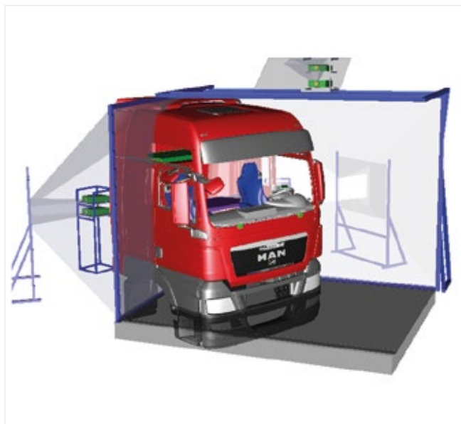
Fig. 1: Truck Driving Cabin as seen in the CAVE.

after using IC.IDO, Obermair explained: "This is how we used to create a new assembly line: from Monday to Friday people work on the assembly line. Then they work on improving the assembly tools and the assembly process. The following Monday through Wednesday they would slowly start the assembly line, which is neither operational nor effective. Sometimes it takes a total of two weeks to make it 100% operational. With IC.IDO, on the other hand, the designers, operators, contractors, suppliers and assembly planner all discuss the new assembly line together. They detect the errors, modify them, finalize the design and begin building the assembly sequence on Friday. By Monday, it's 100% productive."