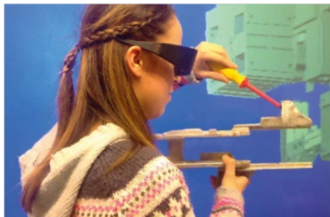
Fig.3 Mountability experiments – virtual assembly parts combined with real tools.