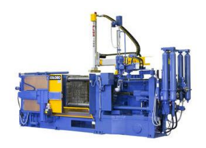
Image: Fully digital Colosio casting machines - for die casting of aluminum, brass, zinc and magnesium alloys.

Casting simulation helps industrial manufacturers and foundries comply with new and increasingly stringent market expectations and achieve the highest quality and productivity possible. To that end, <u>ESI ProCAST</u> provides a complete solution, covering all casting processes and the alloys used in diverse industry sectors and the latest 2016 version focuses on key industrial challenges specifically related to sand, investment and die casting processes in the automotive, aerospace and heavy industries.