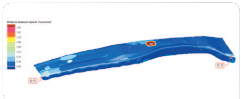
Figure 1: Central Pillar: PAM-STAMP 2G results compared to physical testing

Analysis of the behavior of blanks during the stamping process revealed that the B-Pillar Inner was subject to greater unbending deformation than the Central Pillar.