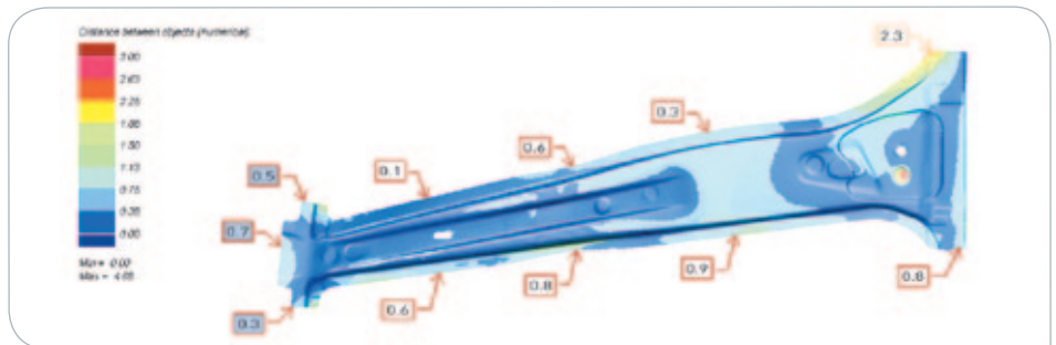
Figure 3: B-Pillar inner: PAM-STAMP 2G results with the Yoshida-Uemori model compare to physical testing. 95.8 % of the points within +/- 1mm