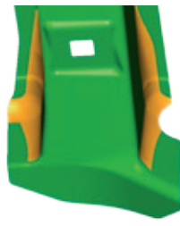
Final geometry determined by stamping analysis

This software is designed to model the initial part and simulate all metal forming operations up to the finished product in order to forecast any potential thinning, wrinkling, twisting, and springback of materials and to develop trim lines.