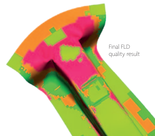
Final FLD quality result