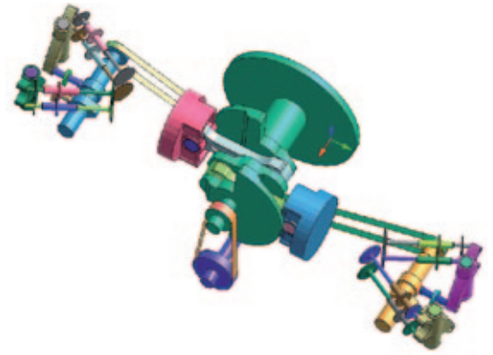
Motorcycle motor dynamics performance.

Parallelization capabilities of Virtual Performance Solution ensure short iteration cycles on real life models and keep the abstraction level to a minimum. This leads to highly accurate results.