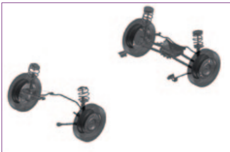
Eigen frequency car suspension.