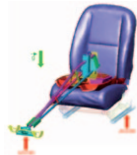
Experimental set-up and Finite Element model with PAM-COMFORT.