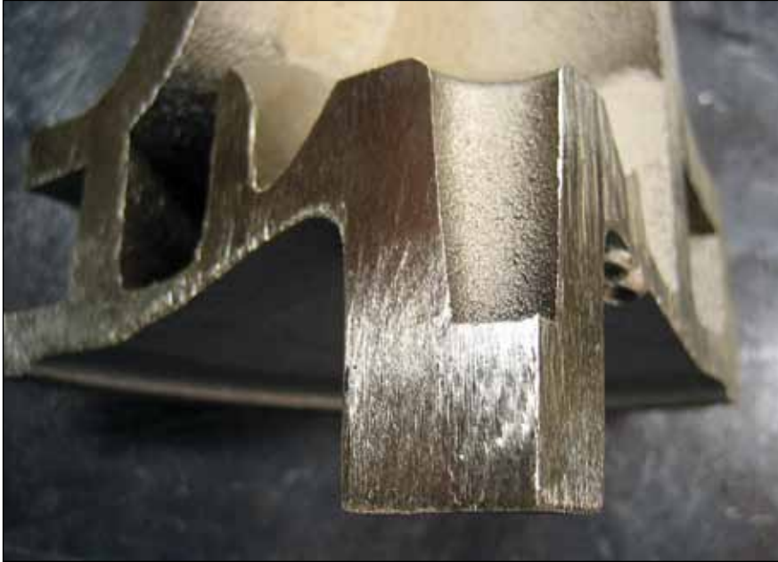
Prior to the use of Quikcast simulation, J. Walter Miller Co. used a closed riser and cored hub design, which produced a shrink pocket in the wear ring.

ware, the metalcasters added a core in the hub to reduce the amount of liquid metal required to feed it dur-