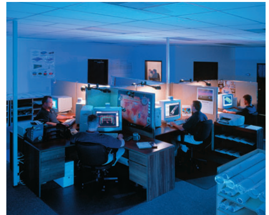
The company's design department

PAM-STAMP 2G also helps Advanced Cam to accurately predict springback, allowing effective die compensation to correct this defect. Springback is a major problem in production, particularly with High Strength Steel as the part shape after springback may not be within tolerance and could be unsuitable for the intended application. The amount of springback depends upon the distribution of stresses at the end of the forming, which in turn results from the properties of the material and the geometry of the part. Using PAM-STAMP 2G, Advanced Cam modifies the tooling geometry to compensate for the effect of springback.