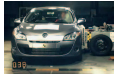
Mégane III lateral crash simulation and EuroNCAP test

“PAM-CRASH is a tailored solution fully adapted to Renault’s problematic especially during the development of the Mégane III.”