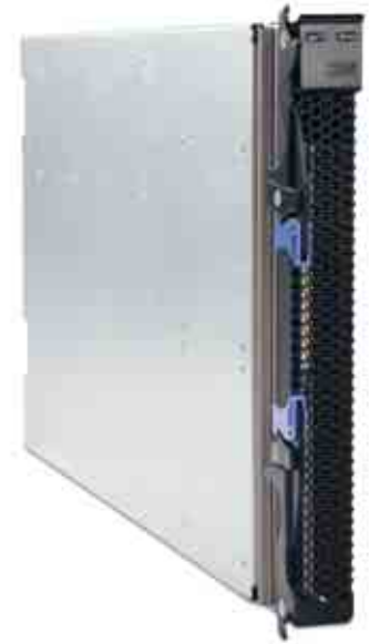
BladeCenter JS21 Server

Applications can be mapped to the hardware architecture that works best, optimizing the overall system. For example, 32-bit applications can continue to run on Intel Xeon processor-based blades while PowerPC 970MP processor-based blades are added. This provides the flexibility to