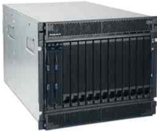
BladeCenter H Chassis with JS21 Blades

along with IBM System Storage™ solutions, can be a cost-effective and a less power-hungry option than traditional server alternatives. Fee services are available for migration to a BladeCenter solution, including implementation and integration within your environment. The resulting solution's aggregate compute power, flexibility and performance can easily compare with higher-priced options.